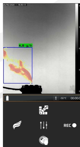
◀ Figure 1 — Quantification

— Very low operating cost due to its uncooled technology.