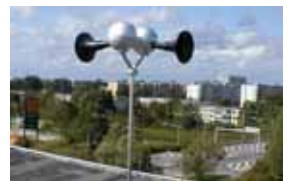
Tyfon CA 370 Sweden.