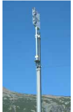
Tyfonic Delta 4 Switzerland.

Sounds like the real pneumatic Tyfon but is completely electrical. TYFON CA 370 can be mounted as a single unit with one horn or as a dual unit with two and comes with a 10m connection cable pre-installed and a thread flange for direct mounting on a 1" pipe. The Tyfon shape ensures optimal lightning protection for the driver units inside the sound emitter.