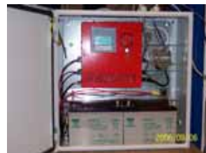
Control Cabinet TK 250-500-750

Kockum Sonics (UK) Ltd. , Unit 7 Leighton Industrial Park, Billington Road, Leighton Buzzard BEDS LU7 8YL, UK Tel: +44 (0) 1525 8523 23, Fax: +44 (0) 1525 8535 05 Email: sales@kockumsonicsuk.com