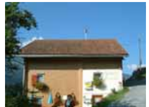
Tyfonic Delta 2 Switzerland.