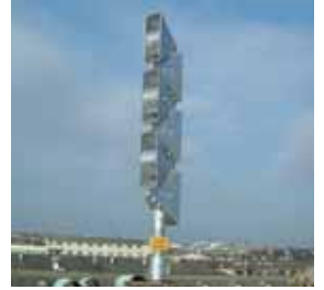
Tyfonic Delta 6 Switzerland

Modern design in combination with excellent sound quality makes the modular Delta sound emitter family perfectly adapted for harsh environmental surroundings. The Delta family is excellent for urban installations with high background noise and sound covering in large rural areas. The unique sound distribution from the folded sound bell pieces assures almost omni directional coverage.